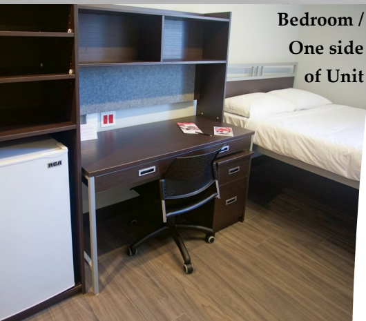
Bedroom / One side of Unit